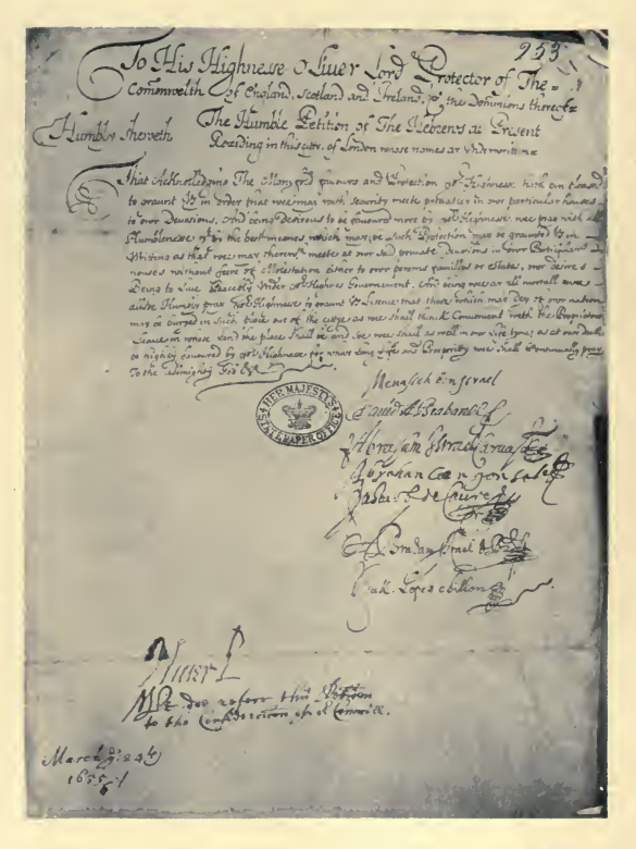
FACSIMILE OF THE JEWS' FIRST PETITION TO OLIVER CROMWELL