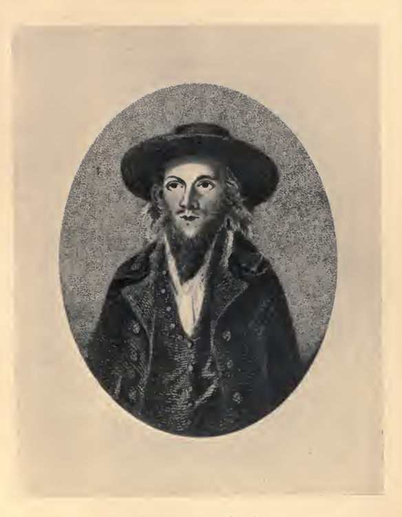
LORD GEORGE GORDON FROM A WATER-COLOUR DRAWING BY POLACE MADE IN NEWGATE