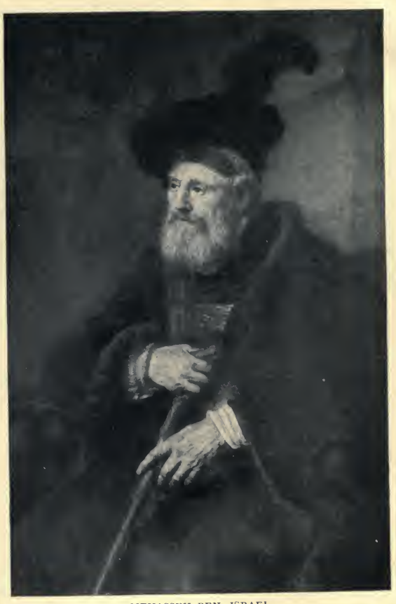
MENASSEH BEN ISRAEL FROM A PORTRAIT BY REMBRANDT